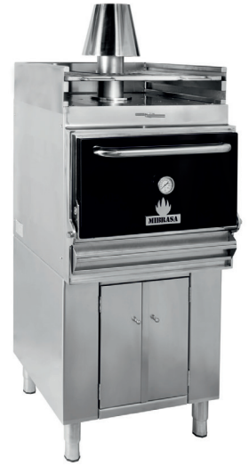
Shown with optional Firebreak