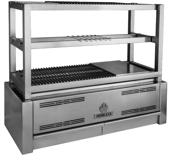
* Photo above features the Robatayaki RM115.