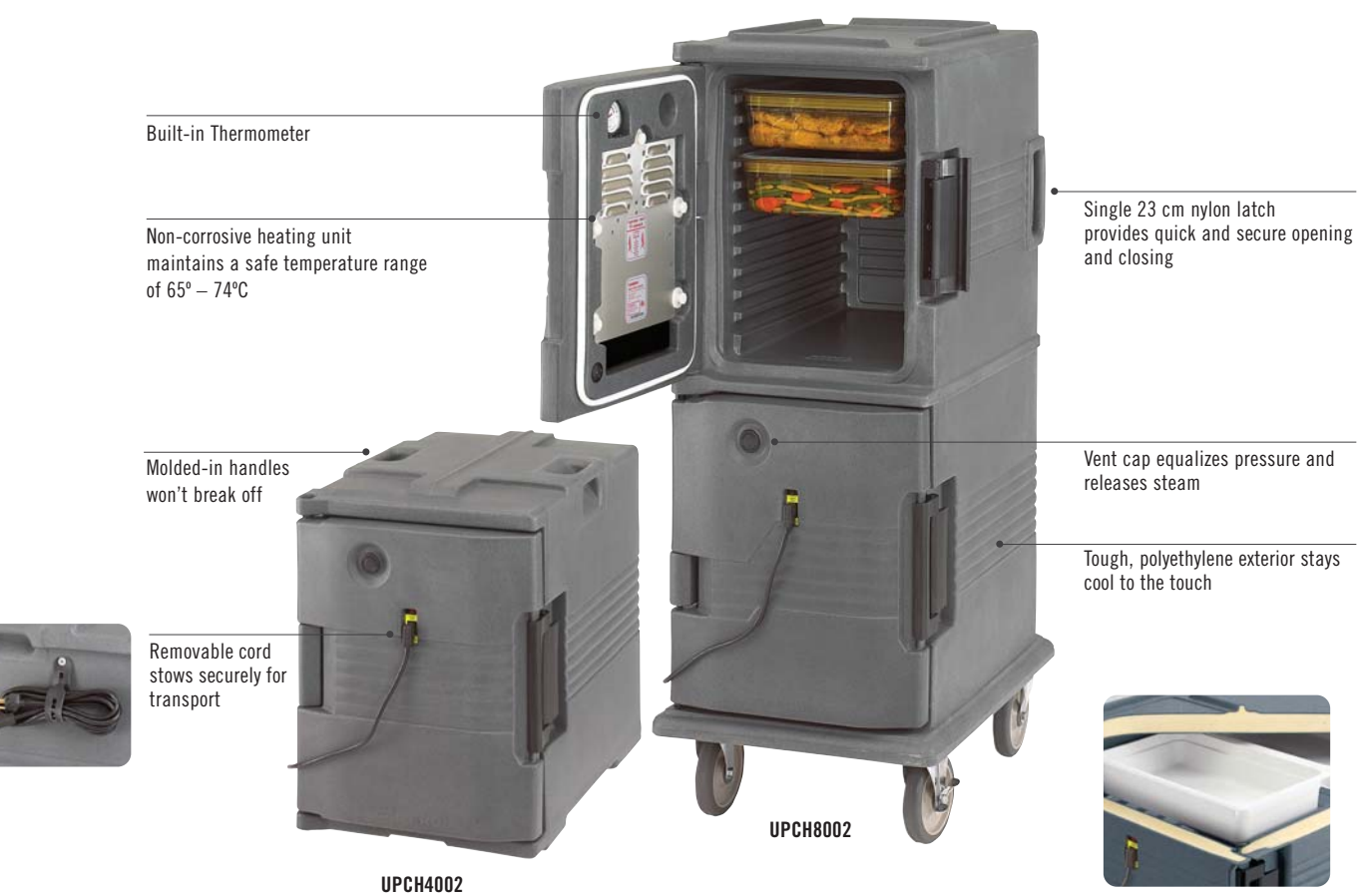
Thick foam insulation retains temperatures for hours, even when unplugged.

Perfect for frequent opening and closing, extreme cold ambient temperatures and longer events, Hot Holding Ultra Pan Carriers<sup>®</sup> and Ultra Camcarts<sup>®</sup> extend hot food holding time and ensure food safety—an economical alternative to large warming cabinets.