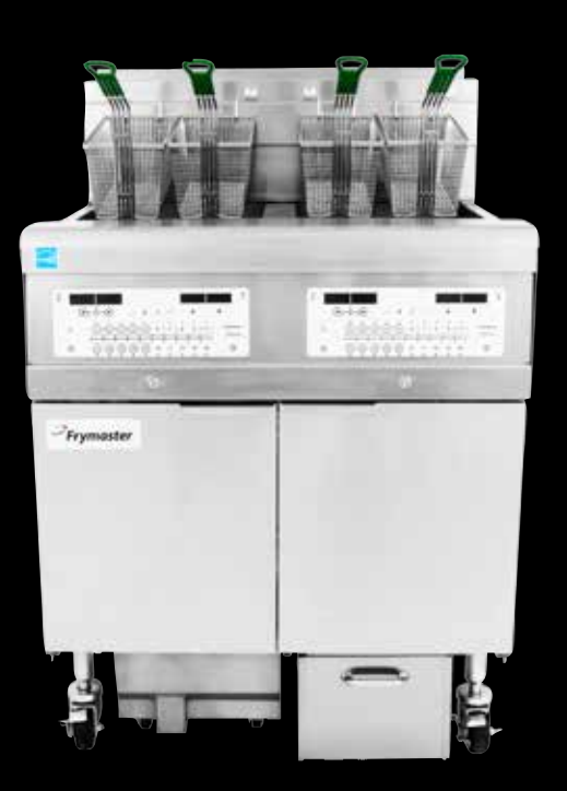
Frymaster FilterQuick<sup>™</sup> Automatic Filtration Fryer